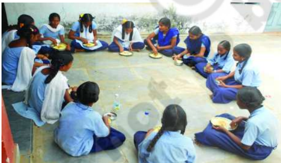
Fig 17.3: Children taking mid day meal in school

The new policy on PDS has been at the center of much debate. We know that about 4 out of 5 people in the rural areas consume less than the minimum required calories. And yet, not even 3 out of 10 families in the rural areas in India possessed BPL and Antyodaya cards, as per the National Sample Survey of 2004. Thus, a large number of people who earlier benefited from the PDS were no longer covered by it. Many families of landless labourers did