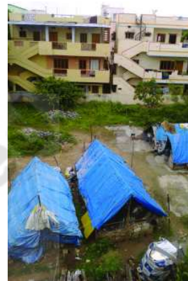
Fig 17.1: Discuss the different living standards in the above urban picture