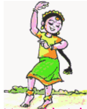
Right to participate in cultural programmes