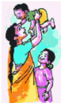
Right to receive love and affection