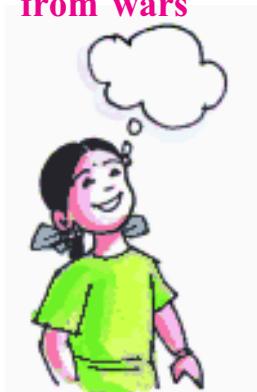
Right to freedom of thought