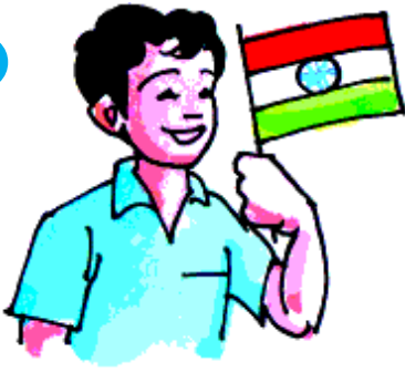
Right to adopt any nationality