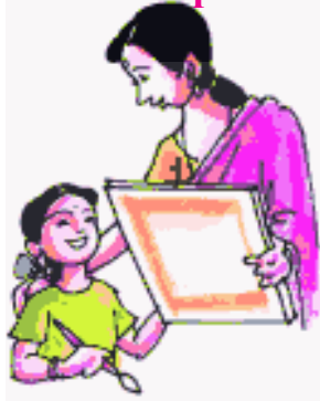
Right to appreciation