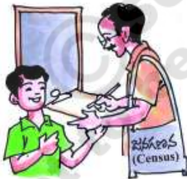
Right to get identified as citizen