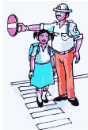
Right to get social safety