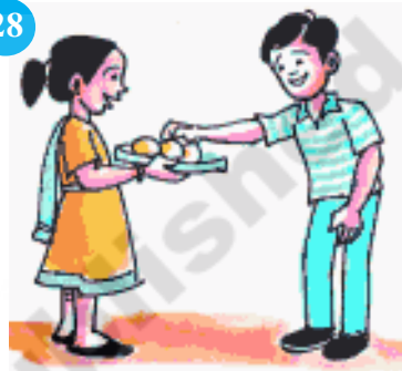
Right to have love and friendship