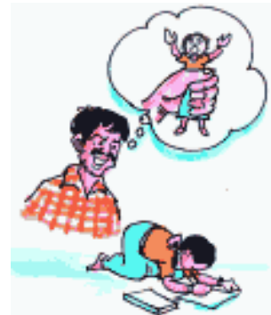
Right to get protected from sexual (Mental & Physical) exploitation