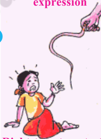
Right to get protection from violence