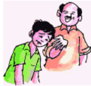
Right to get protection from humiliation