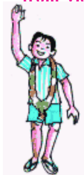
Right to get honoured