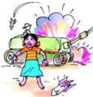
Right to get protection from wars