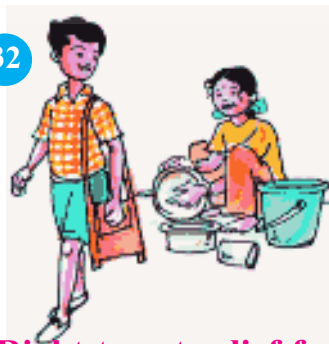
Right to get relief from social discrimination