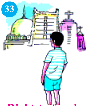
Right to freedom of Religion