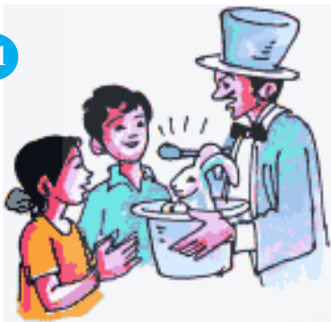
Right to have fun