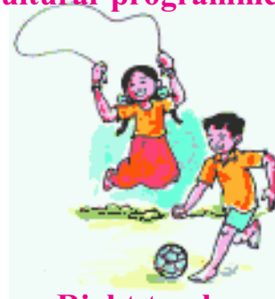
Right to play