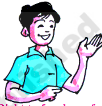
Right to freedom of expression