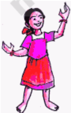
Right to survival