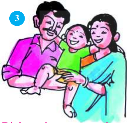
Right to have parental protection