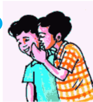
Right to get information