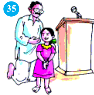
Right to get equal cultural opportunities