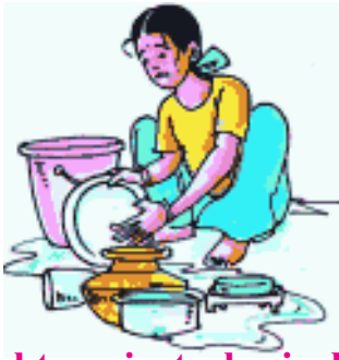
Right against physical and economical exploitation