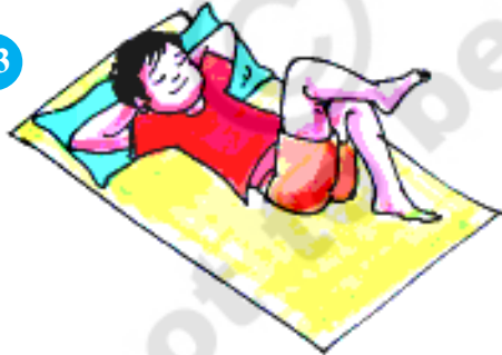
Right to relaxation