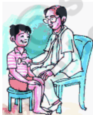
Right to get equal health opportunities