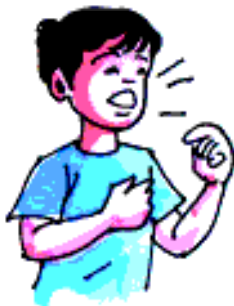
Right to express one's feelings