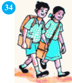
Right to receive equal educational opportunities