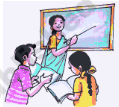
Right to get free and quality education