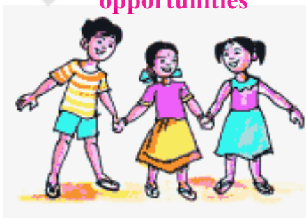
Right to social equality