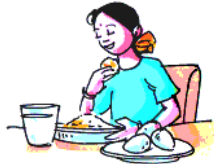
Right to get nutritious food