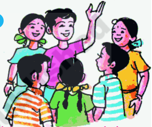
Right to conduct associations