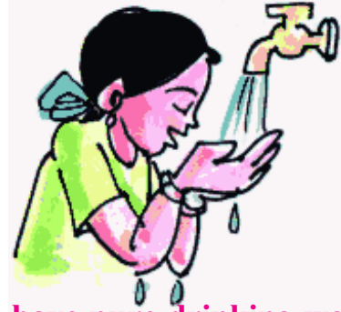
Right to have pure drinking water