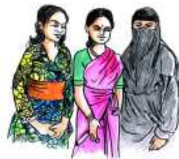
Fig. 20.3: You cannot vote if you are women