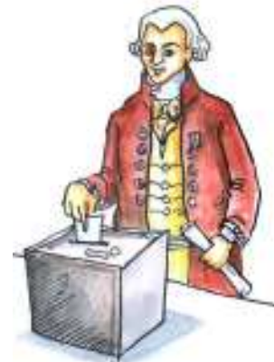
Fig. 20.2: You can vote if you are educated