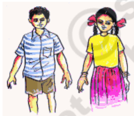
Fig. 20.5: You can't vote because you are too young

the plan of work etc. Secondly, any citizen has a right to demand information on any work done by the government and the government has to make open such information. Thirdly, after a definite period elections will be held again and the functionaries have to seek fresh election from the people. The people can ask them to explain their work and reject them if they are not satisfied.