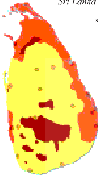
Map 2: Ethnic Communities of Sri Lanka

Sinhalese Sri Lankan Tamil Indian Tamil Muslim