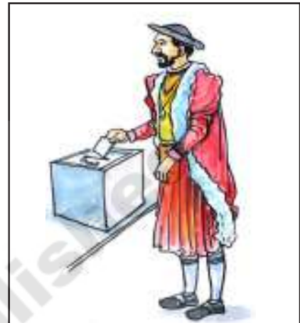
Fig. 20.1: You can vote if you pay tax

The elected government functionaries are answerable to the people in different ways. First of all there will be elected assemblies in which the government functionaries will be asked to explain their work and which will approve