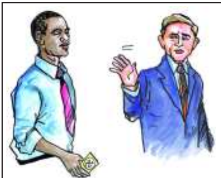
Fig. 20.4: You can't vote because you belong to different race