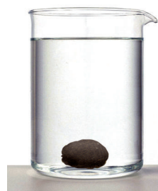
Fig-2 Swollen kishmish kept in tap water

Then take 100 ml of saturated solution of sugar in a beaker, which was already prepared.