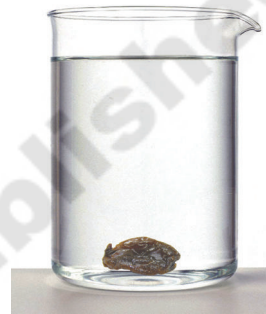
Fig-1 Kishmish kept in tap water

Procedure: Take 100 ml of water in a beaker. Keep dry raisin (kishmish) in it.